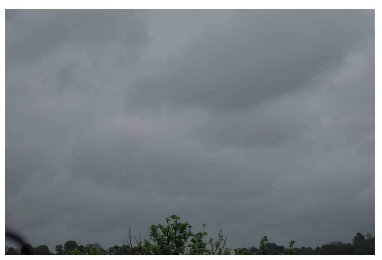
Fig. 4.2 for Question 4